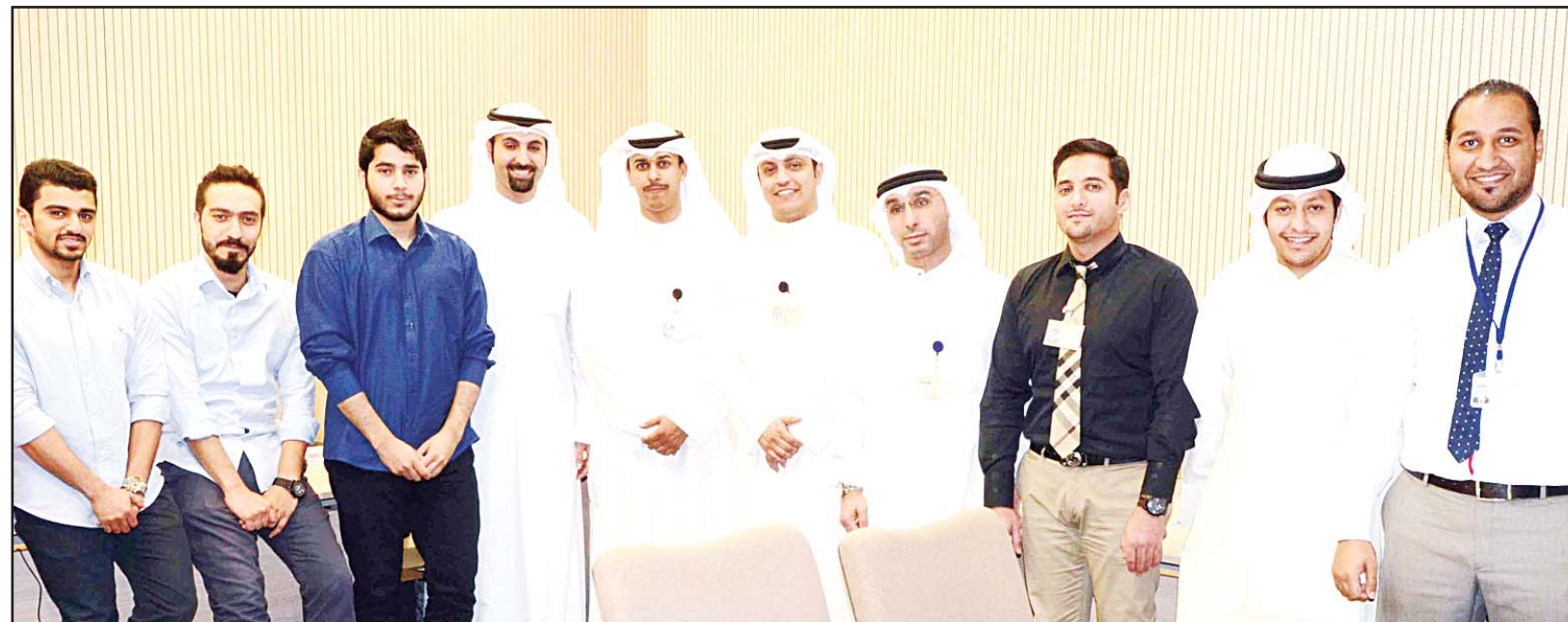
AUB employees pose for a group photo during the event.

or salary will also be eligible to enter the monthly cash draws for a chance to also win up to KD 1,000. In addition, the quarterly car draw will be for 1 lucky winner who will have a chance to win a new Cadillac CTS. For further information about Gulf Bank's red account and other prize draws, visit one of Gulf Bank's 56 branches, call the Customer Contact Center on 1805805, or go online at www.e-gulfbank.com.