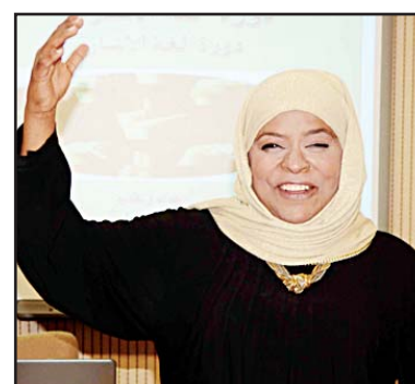
An employee gestures during the training courses.

Amin reassured that the Bank and its Executive Management fully support reinforcing the various capabilities and skills of its staff which is reflected by the sustained success in gaining the confidence of our clients of various categories and segments.