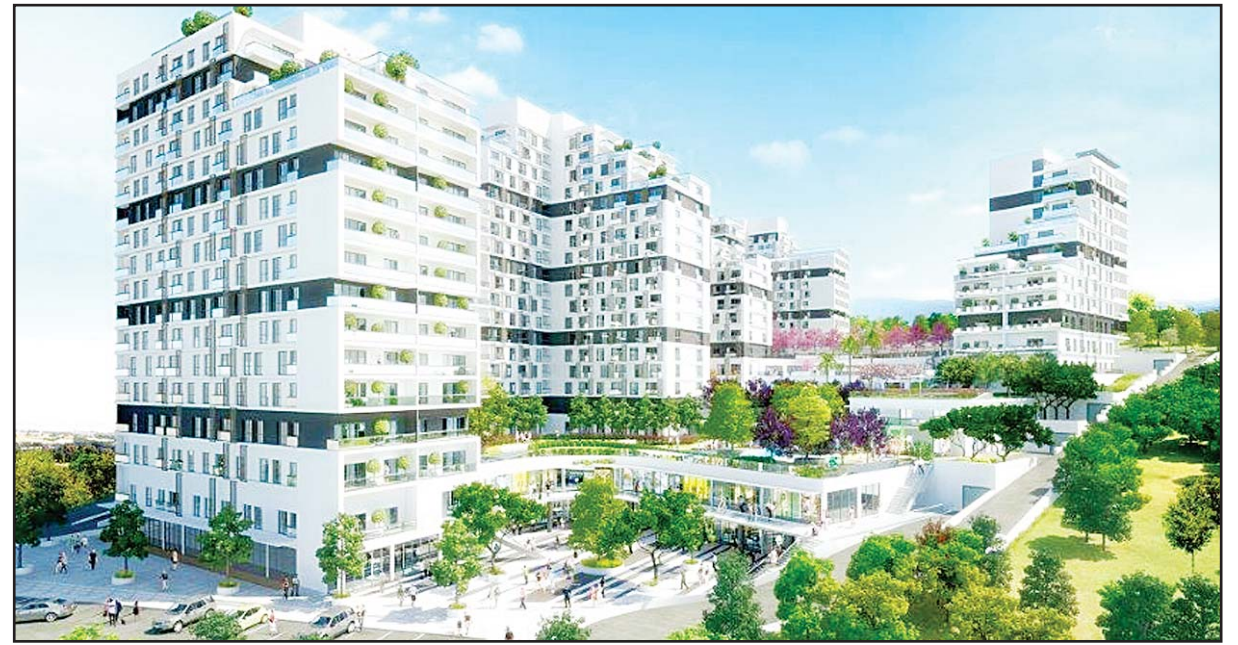
Terrace Lotus in Beylikduzu

The consumer market activity absorbs, and copes with, the financial and economic developments.