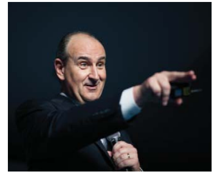
School and media support from the International Advertising Association Kuwait Chapter.

The Cultural Transformation Workshop will take place on 18th-19th April 2016 from 9:00AM to 4:00PM at Jumeirah Messilah Beach Hotel and will be part of the Knowledge ClubTM 2016 series which is organized by Vigor Events and co-organized by ALGAS Events. And sponsored by Zain Telecommunication Company as the lead Partner. Other Sponsors include Hadi Clinic as Gold Sponsor, Gulf Bank & Warba Insurance as Silver sponsors, Platinum Gym & Warba Bank as Event Sponsors, Corporate Sponsor Kuwait Oil Company, Success Partner Equate, Strategic Partner Ahli Bank of Kuwait, Executive Education Partner IE Business