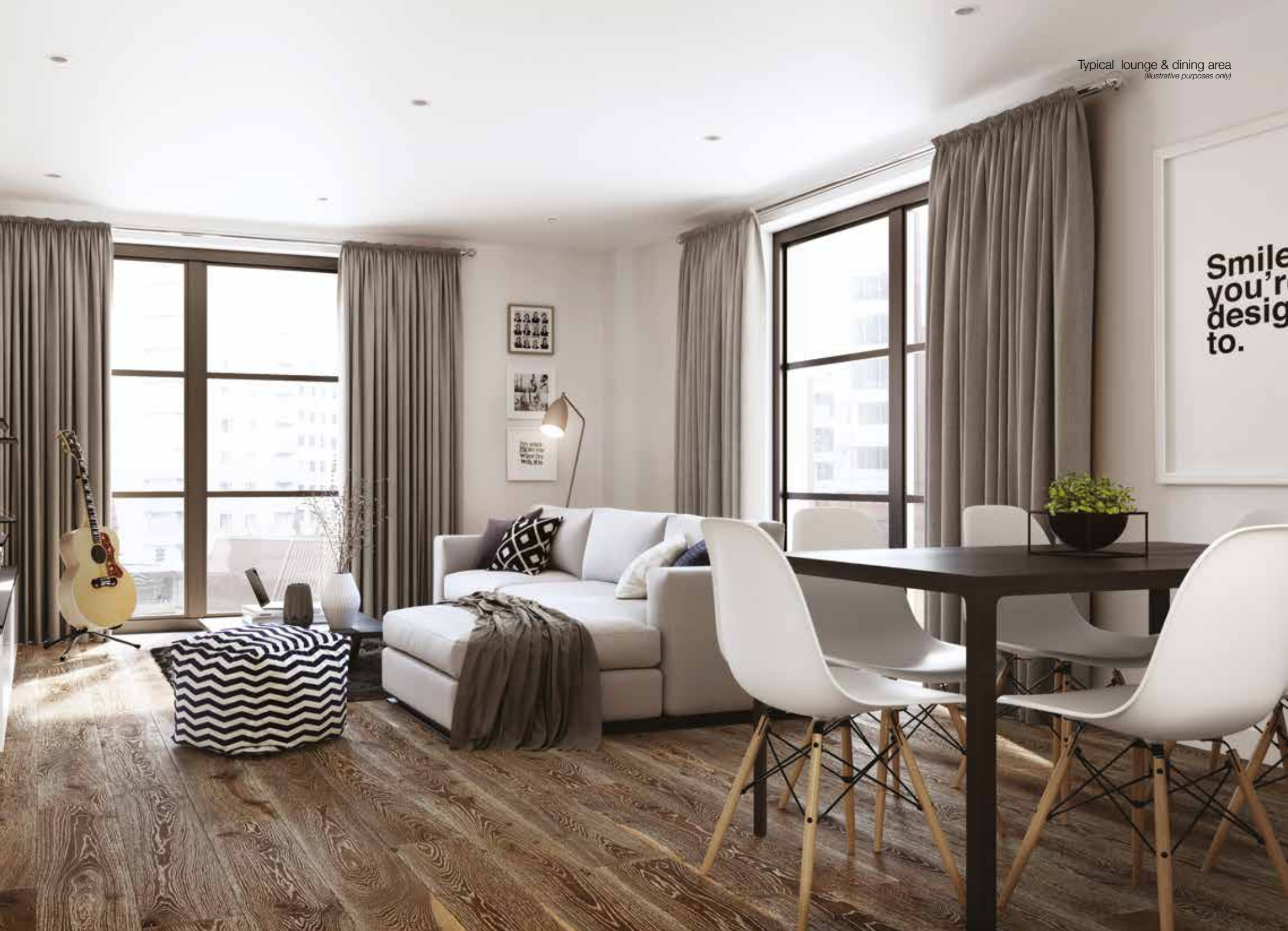
Typical lounge & dining area (illustrative purposes only)