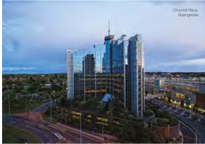
Churchill Place, Basingstoke