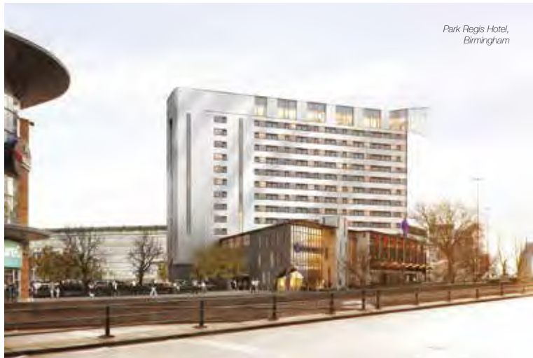
Park Regis Hotel, Birmingham