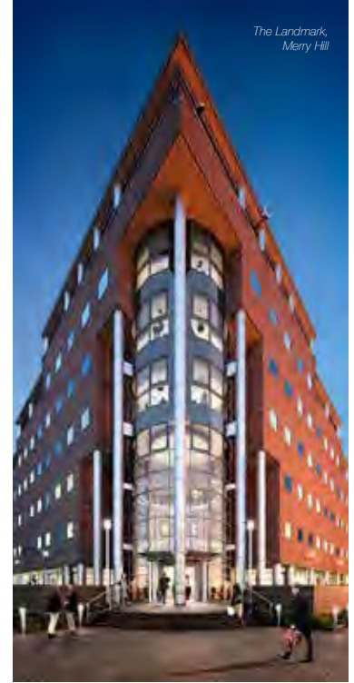
The Landmark, Merry Hill