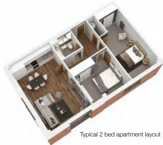
Typical 2 bed apartment layout