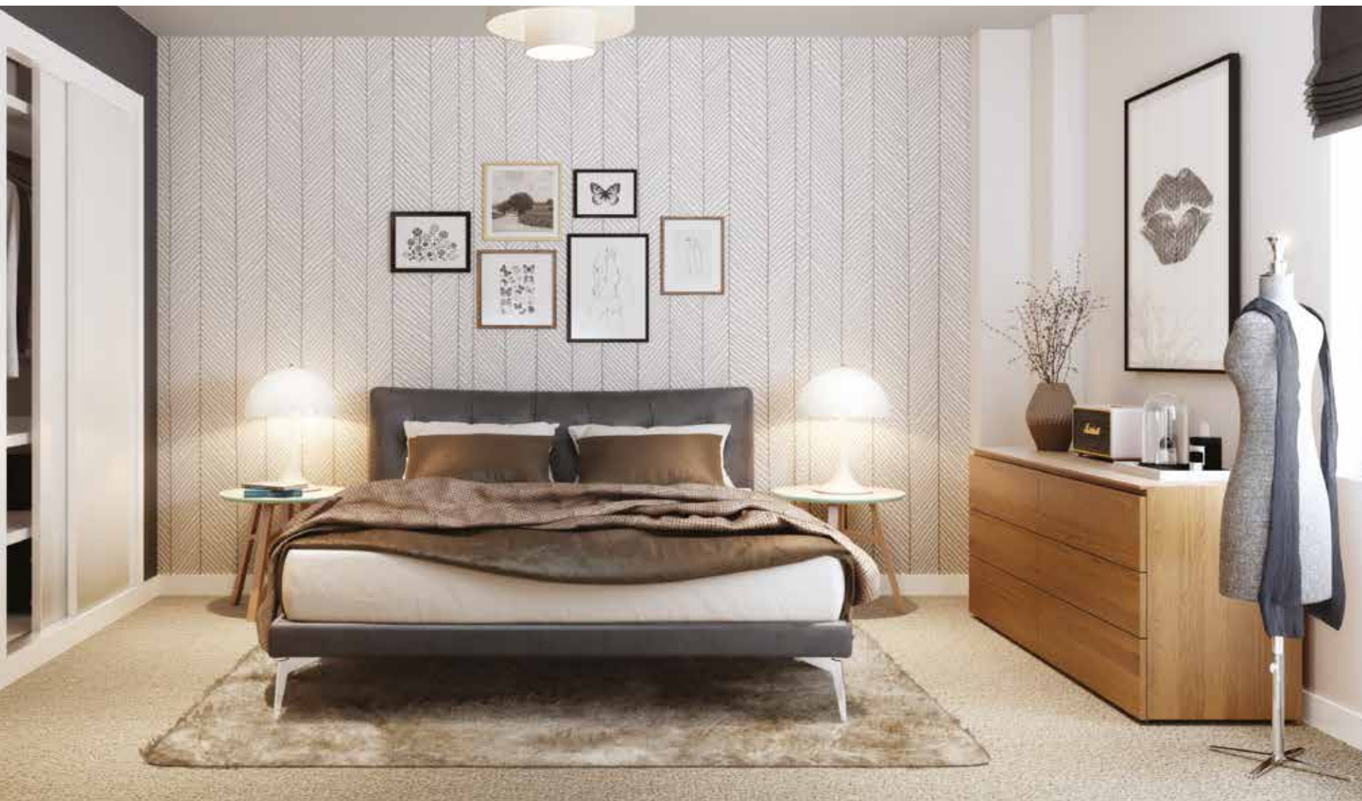
Typical bedroom interior

DISCLAIMER: In accordance with the Misrepresentation Act 1967, the Consumer Protection from Unfair Trading Regulations 2008 and the Business Protection from Misleading Marketing Regulations 2008, the details contained in this brochure do not form part of any specification or contract. While the information has been prepared in good faith, all and any such responsibility and liability is expressly disclaimed by Seven Capital and its agents. Any buyer must satisfy themselves by inspection or otherwise as to the accuracy of any information given. This brochure has been prepared for the exclusive use and benefit of the person to whom it was given by the seller and solely for the purpose for which it is provided. Unless we provide express prior written consent, no part of this brochure should be reproduced, distributed or communicated to any third party. We do not accept any liability if this report is used for an alternative purpose from which it is intended, nor to any third party in respect of this report.