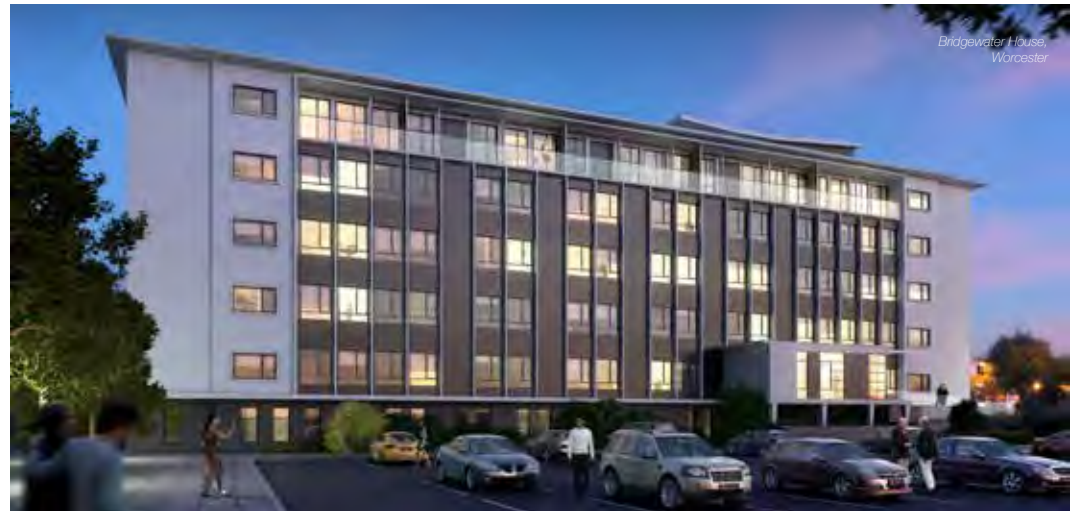
Bridgewater House, Worcester