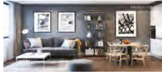
Madison House, Birmingham