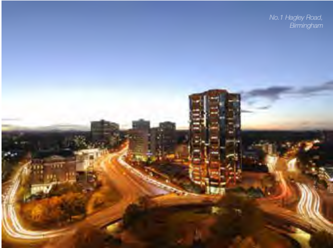
No.1 Hagley Road, Birmingham