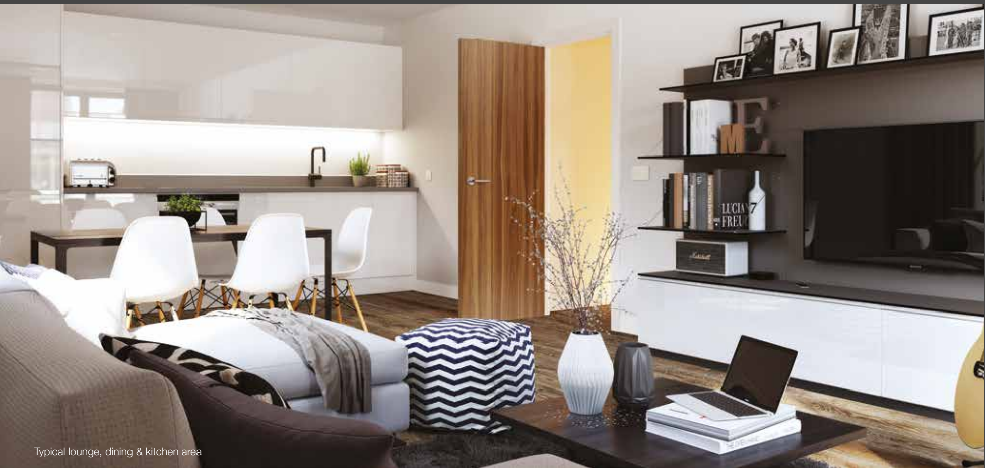
Typical lounge, dining & kitchen area