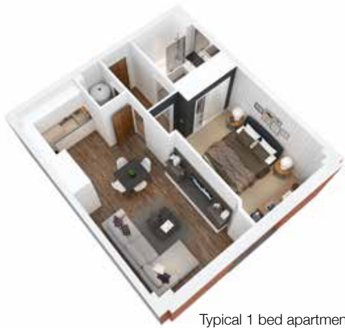
Typical 1 bed apartment layout