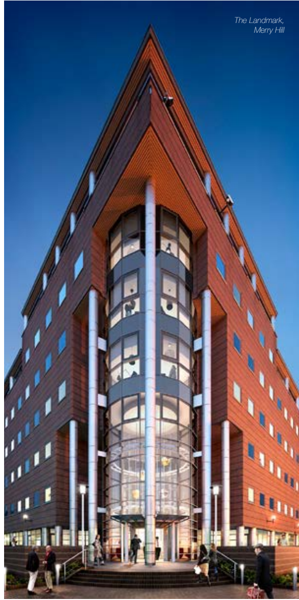
The Landmark, Merry Hill