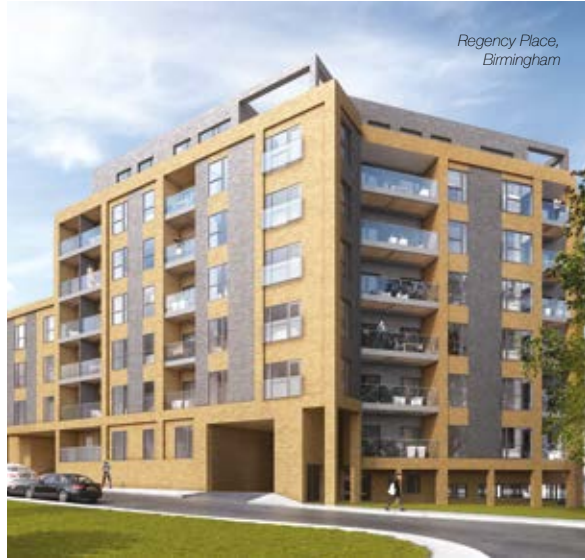
Regency Place, Birmingham