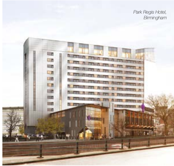
Park Regis Hotel, Birmingham