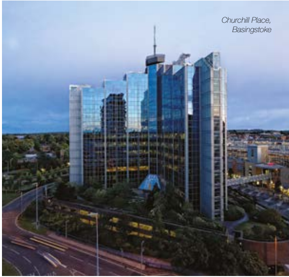
Churchill Place, Basingstoke