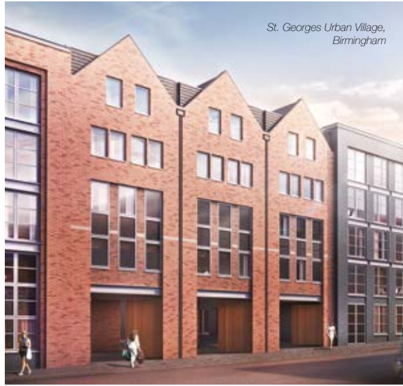
St. Georges Urban Village, Birmingham