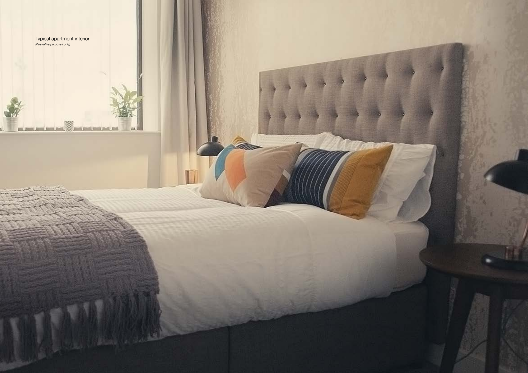
Typical apartment interior (illustrative purposes only)