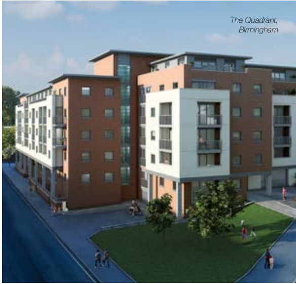
The Quadrant, Birmingham