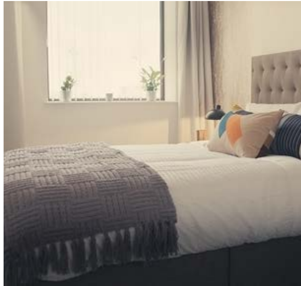
Typical apartment interiors (Illustrative purposes only)