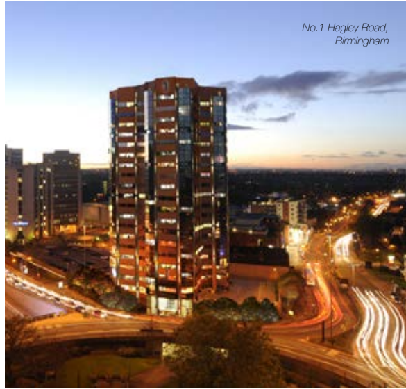
No. 1 Hagley Road, Birmingham